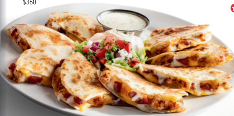
鄉村培根卡薩帝亞 BACON RANCH QUESADILLAS WITH GRILLED CHICKEN