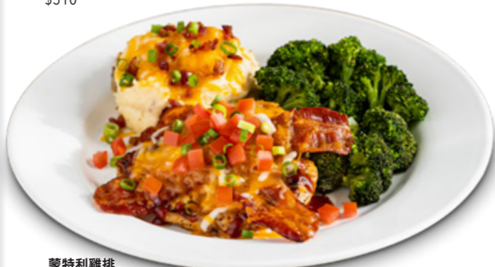
蒙特利雞排 MONTEREY CHICKEN®

嫩烤雞胸淋上經典BBQ醬，搭配培根、綜合起司、蕃茄丁與青蔥。附上特製馬鈴薯泥與蒸綠花椰菜。 Grilled chicken breast topped with BBQ sauce, crispy bacon, cheese, diced tomatoes and green onions. Served with loaded mashed potatoes & steamed broccoli. $510