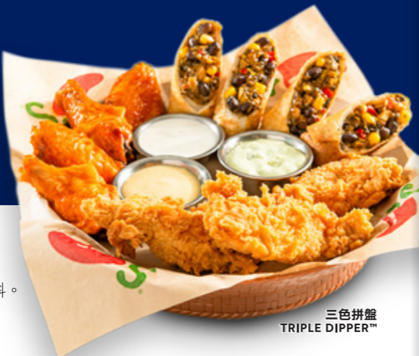
三色拼盤 TRIPLE DIPPER™

任選三樣開胃菜！ Choose any three Served with dipping sauces. $590