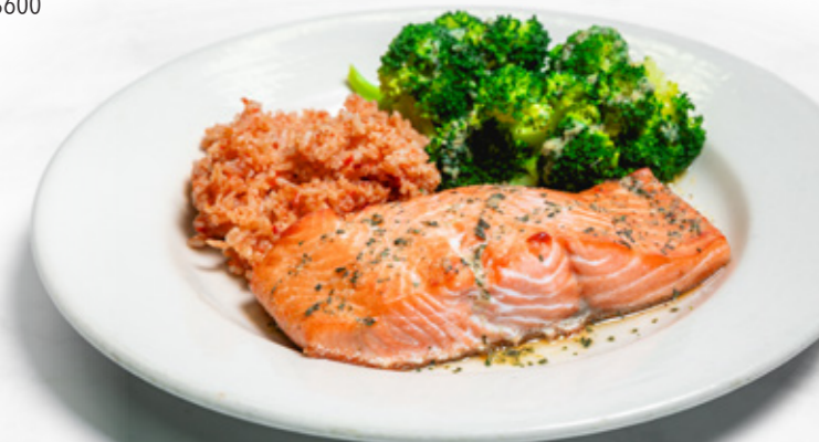
蒜香奶油香草鮭魚 GRILLED SALMON WITH GARLIC BUTTER & HERBS

鮭魚菲力佐蒜香奶油與香草調味，附香料飯與蒸綠花椰菜。 Salmon fillet seasoned with garlic butter & herbs. Served with rice & steamed broccoli. $600