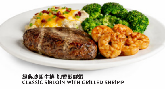
經典沙朗牛排 加香煎鮮蝦 CLASSIC SIRLOIN WITH GRILLED SHRIMP

鮮嫩多汁！ 均附特製馬鈴薯泥及蒸綠花椰菜 THICK AND JUICY. SERVED WITH LOADED MASHED POTATOES AND STEAMED BROCCOLI.