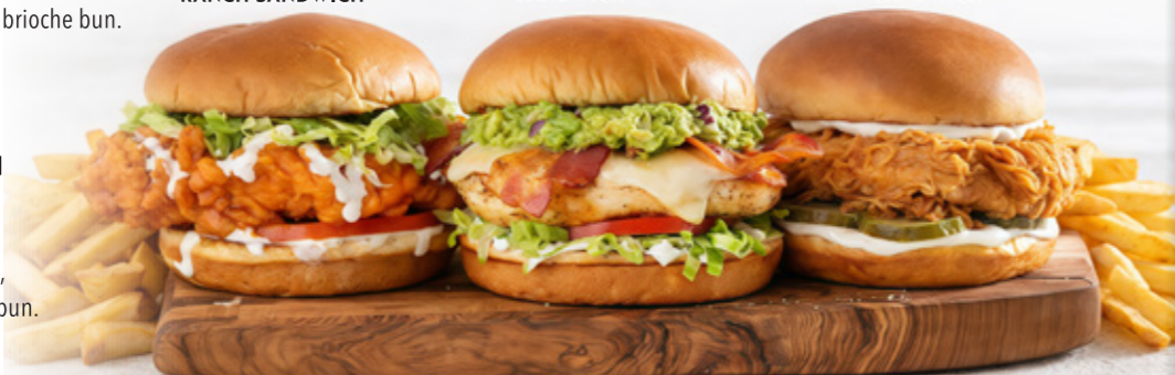
香辣水牛城雞肉堡 BUFFALO CHICKEN RANCH SANDWICH