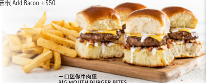
一口迷你牛肉堡 BIG MOUTH BURGER BITES