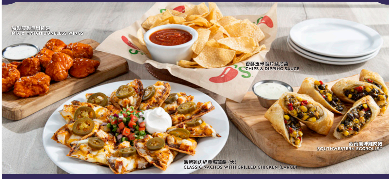
特製雙醬無骨雞翅 MIX & MATCH BONELESS WINGS