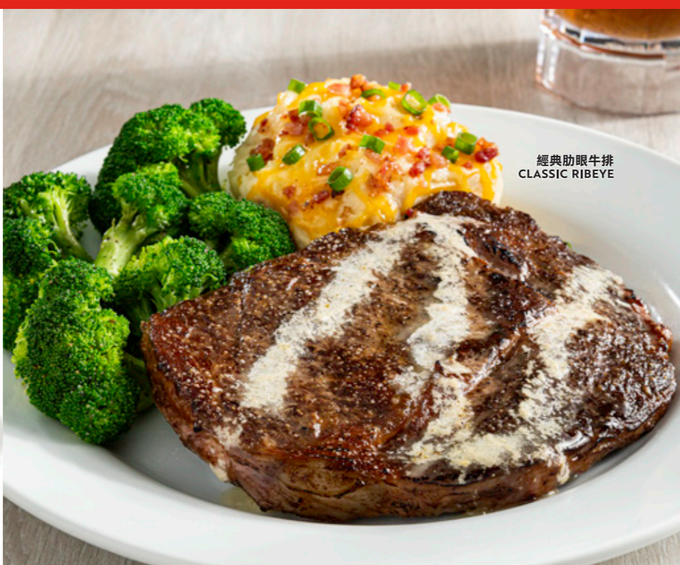
經典肋眼牛排 CLASSIC RIBEYE