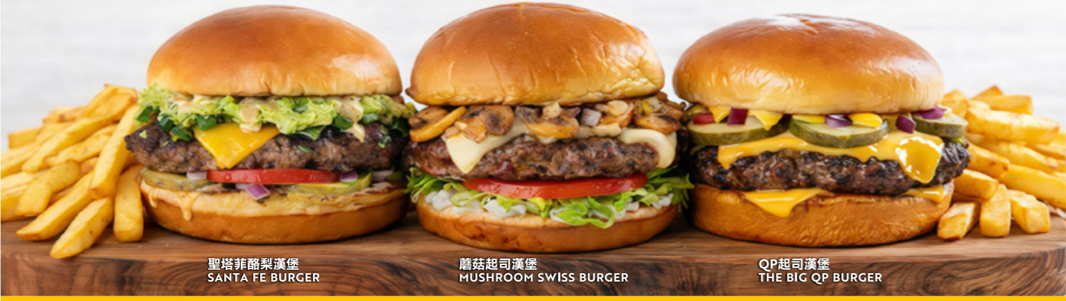
聖塔菲酪梨漢堡 SANTA FE BURGER