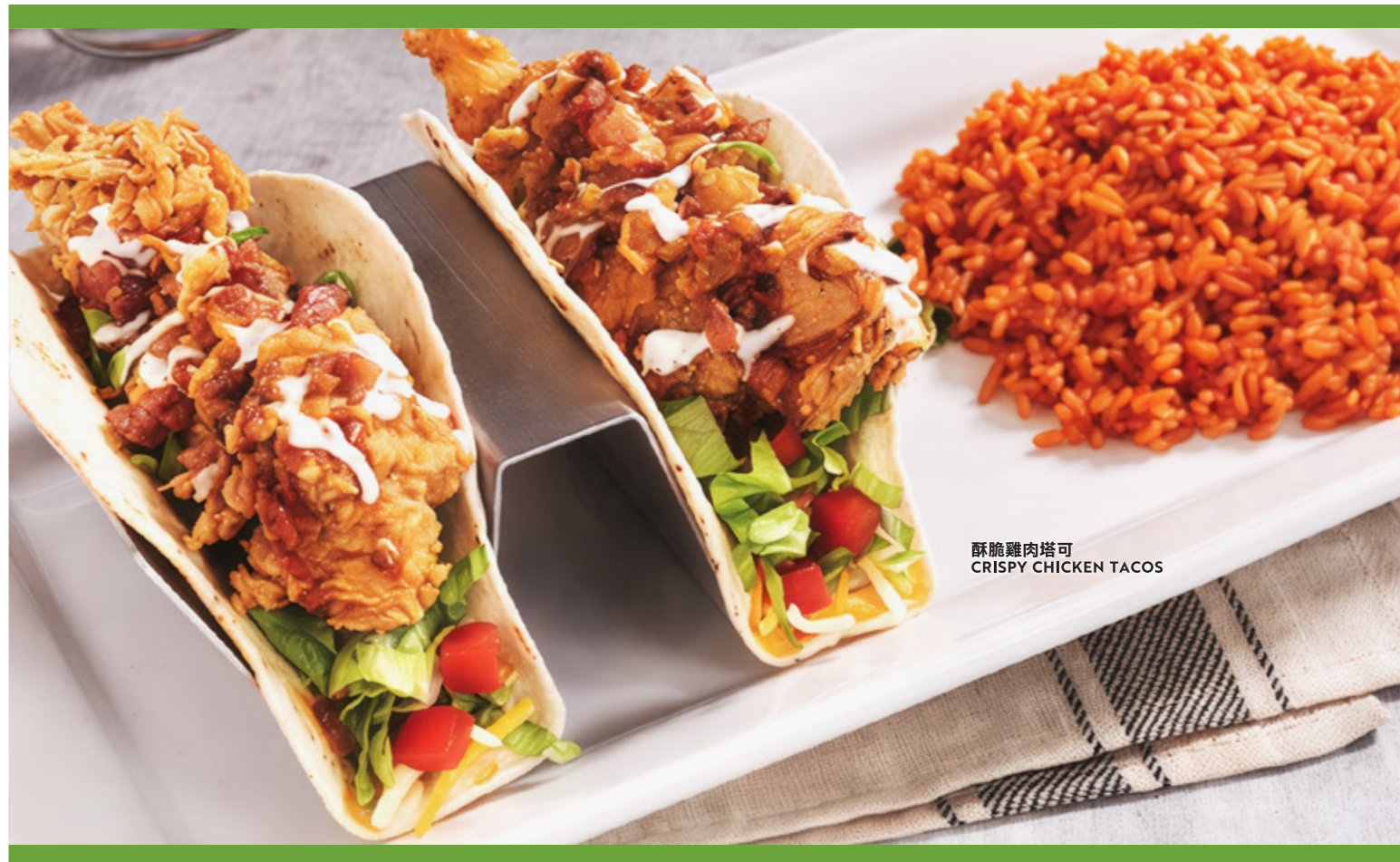
酥脆雞肉塔可 CRISPY CHICKEN TACOS