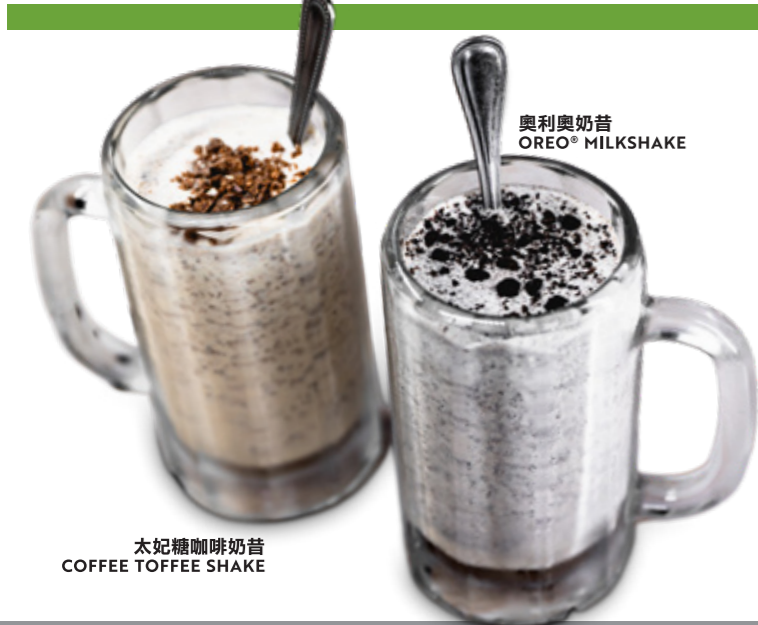
奧利奧奶昔 OREO® MILKSHAKE