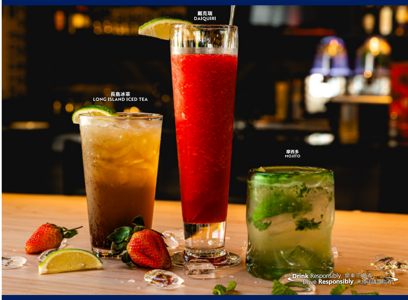
長島冰茶 LONG ISLAND ICED TEA