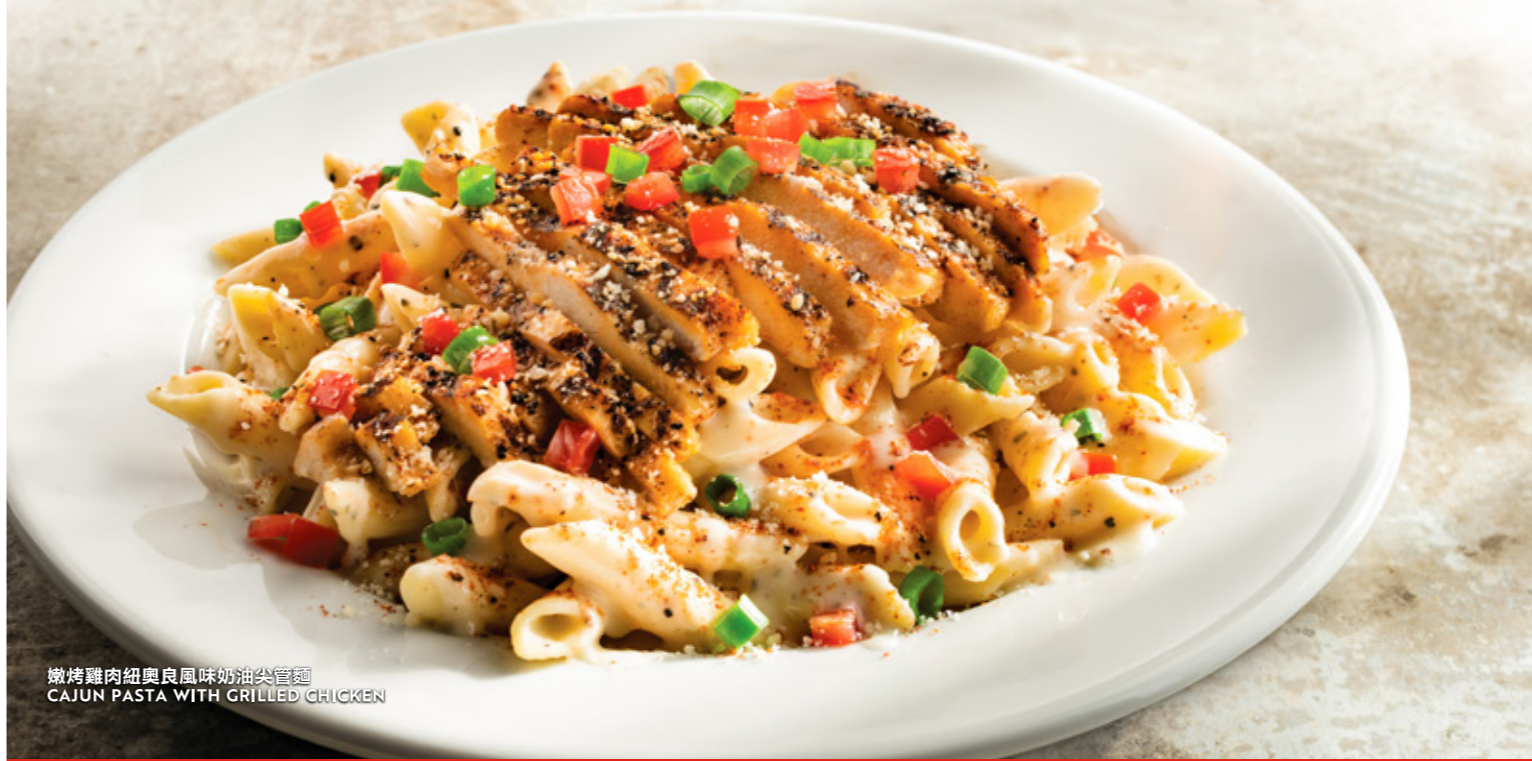
嫩烤雞肉紐奧良風味奶油尖管麵 CAJUN PASTA WITH GRILLED CHICKEN