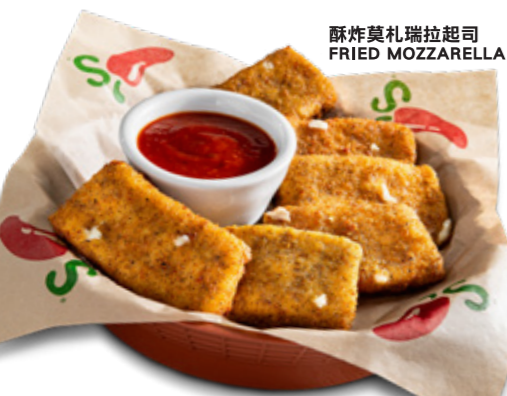
酥炸莫札瑞拉起司 FRIED MOZZARELLA

搭配義式蕃茄醬。 Served with marinara sauce. · 適合分享 6塊 Shareable 6 Count $550 · 小份 3塊 Small 3 Count $290