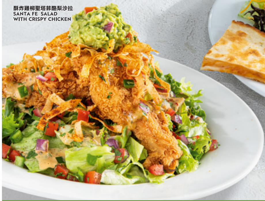
酥炸雞柳聖塔菲酪梨沙拉 SANTA FE SALAD WITH CRISPY CHICKEN