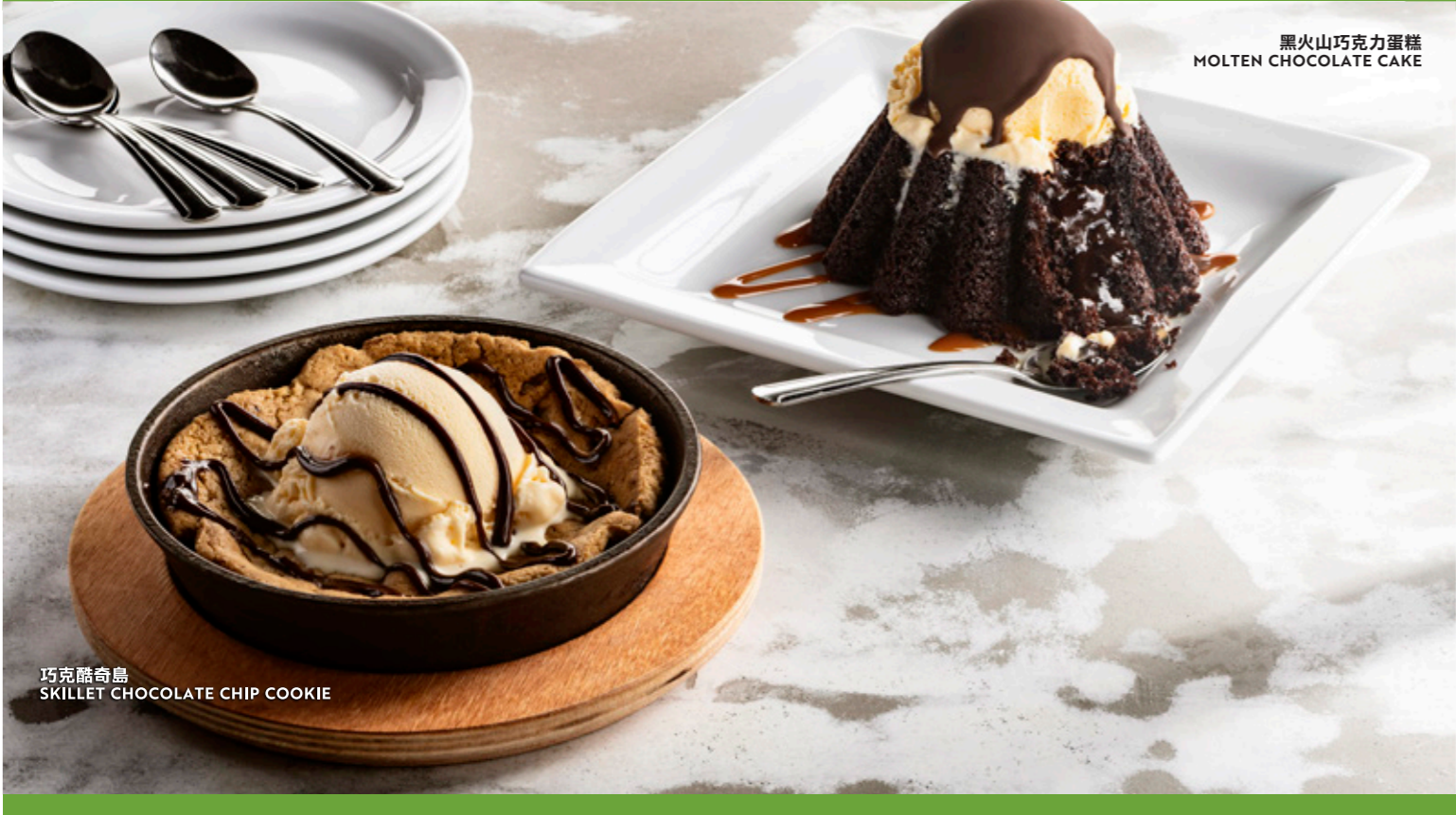
黑火山巧克力蛋糕 MOLTEN CHOCOLATE CAKE