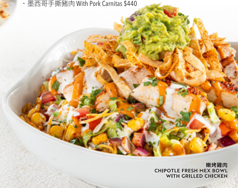
嫩烤雞肉 CHIPOTLE FRESH MEX BOWL WITH GRILLED CHICKEN